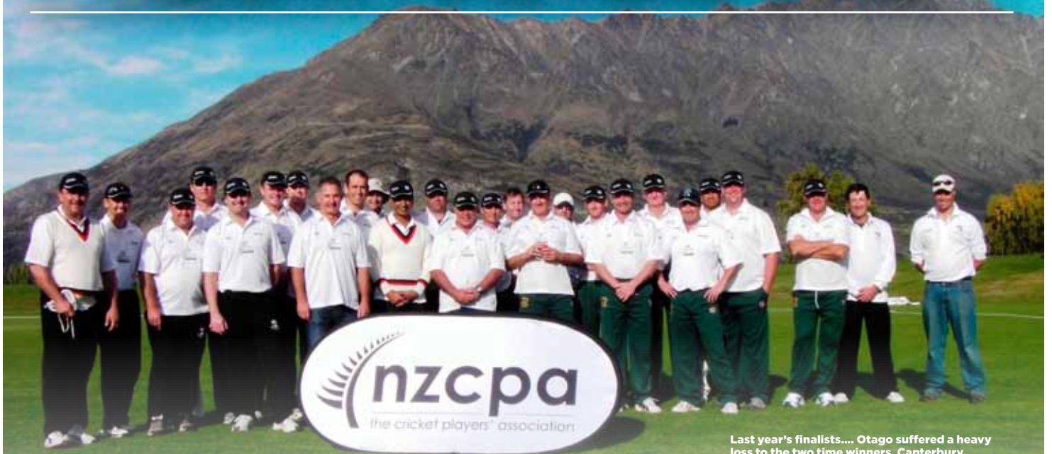
Last year's finalists.... Otago suffered a heavy loss to the two time winners, Canterbury.

The NZCPA Masters Weekend is the premium event for our Past Player Members. Once again we will be heading to Queenstown to enjoy a long weekend of golf, wineries, cricket and catching up. On the back of record numbers last year (90 attendees) we look to keep growing and improving on what is already a must-attend event for our former first class players.